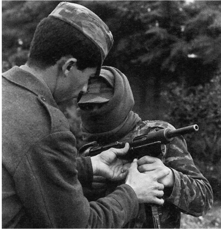
A young Fatah member being trained in the use of his weapon.

21 Study the photograph, and then answer the questions which follow.